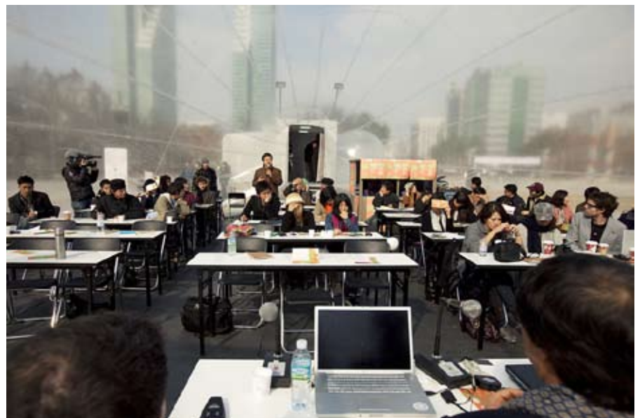
Top Anyang Public Art Project 2010 conference for artists