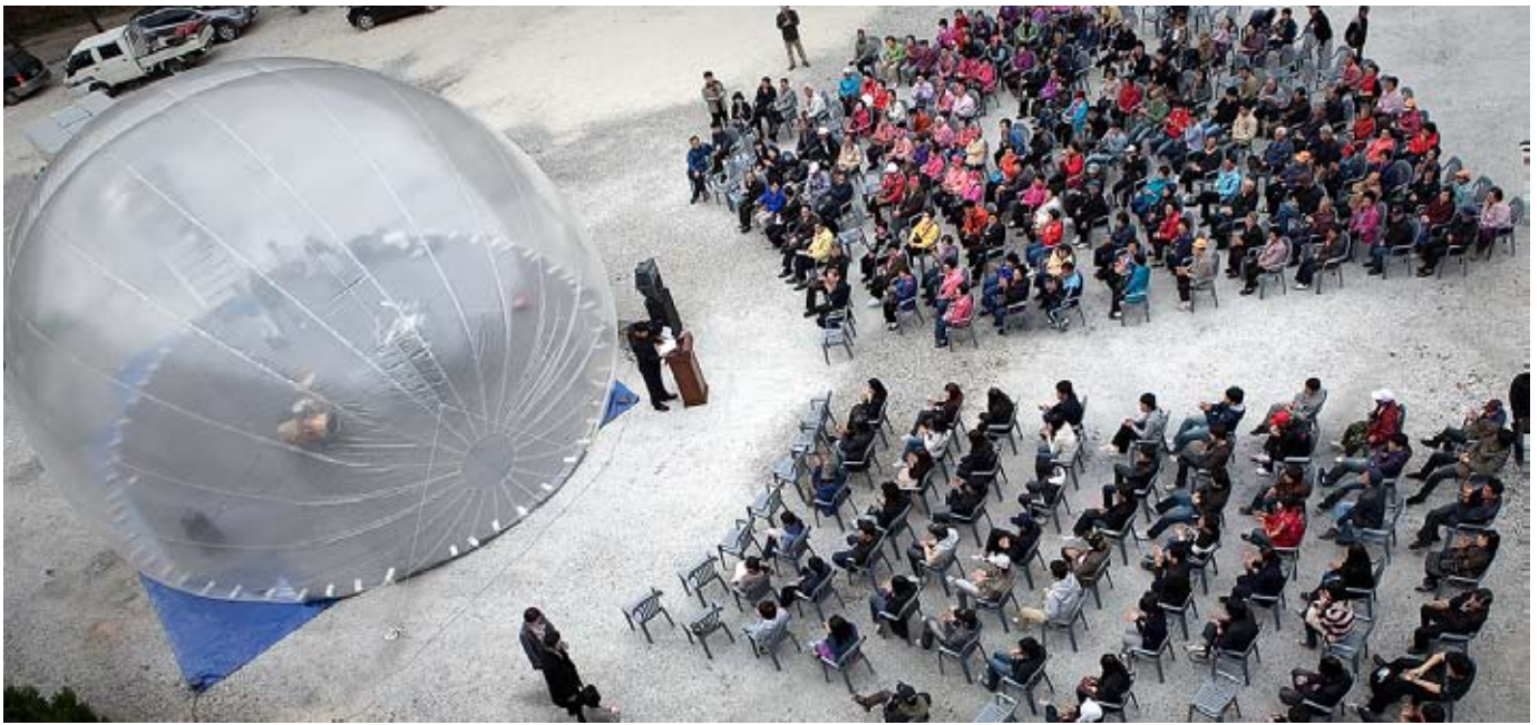
A concert performance in a parking lot with musicians enclosed within the bubble, audiences seated outside

Unlike its counterparts, Bang Bang is mobile, drifting through the OPEN CITY transporting and translating the topic of APAP 2010: art as a generator of urban processes