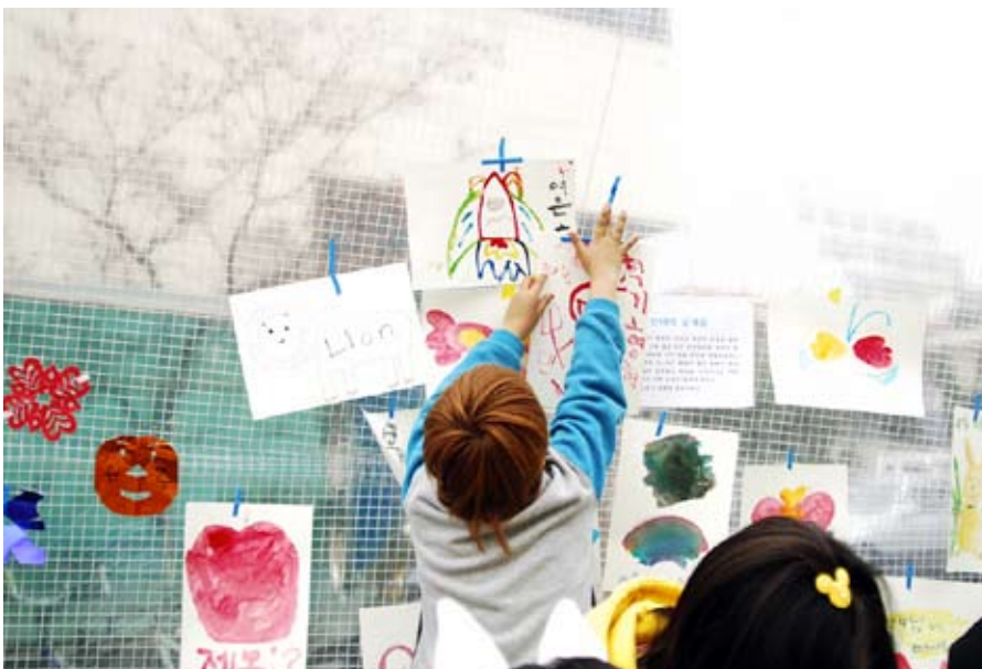
Bang Bangs walls provide an exhibition space for a local workshop

Bang Bang is touring through the urban landscape between Seoul and Anyang since September 2009 by invitation for the 3rd Anyang Public Art Project (APAP2010), Anyang, South Korea.