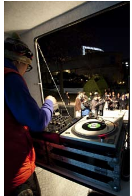
Left The many transformations of Bang Bang - its flexible form allows for a multiplicity of activities to unfold and instant space to happen. Right A platform for a DJ set and dance floor